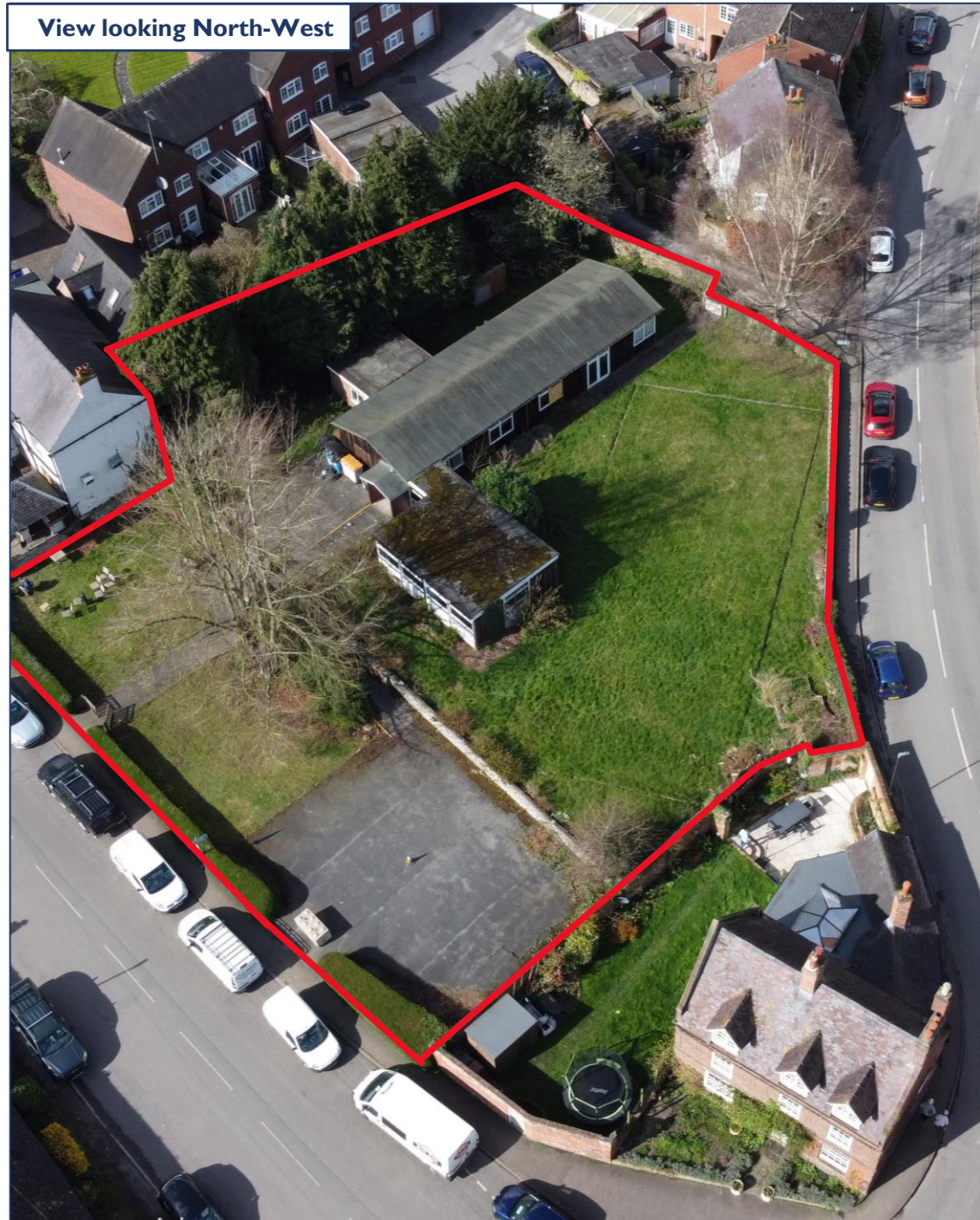
View looking North-West