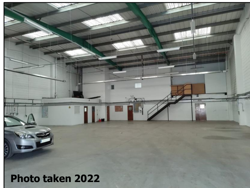
Photo taken 2022