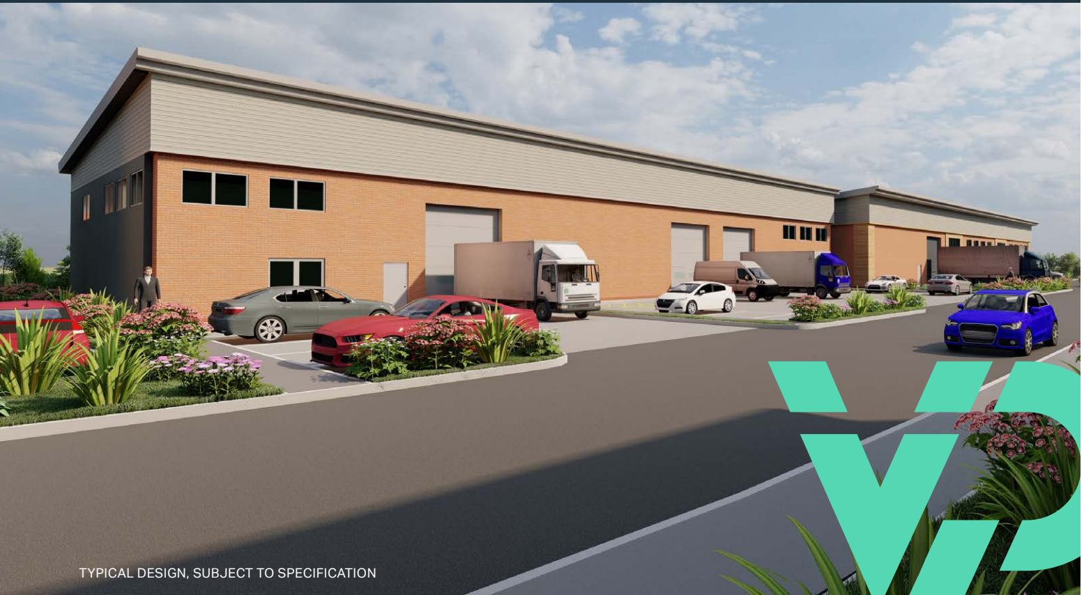
TYPICAL DESIGN, SUBJECT TO SPECIFICATION

Phase 1: 12,000 sq ft pre sold to Network Rail Limited