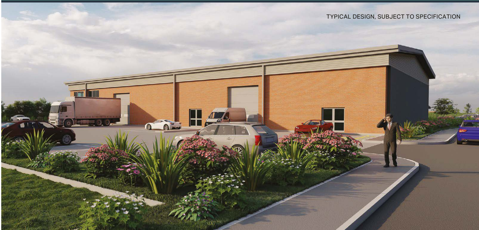
TYPICAL DESIGN, SUBJECT TO SPECIFICATION

Units can be constructed to suit occupier's specific requirements, although an outline planning consent has been granted to allow for the further development of units from 1,700 sq ft in accordance with the indicative layout shown.