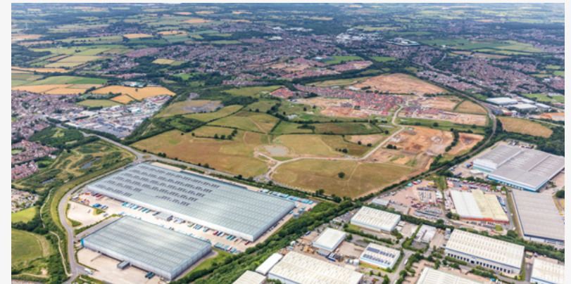
Entrance Gateway Visual

The Local Quarter presents an excellent opportunity to service an established customer base located within Bardon Hill Industrial Estate, together with the significant passing trade along Beveridge Lane. There is a shortage of retail and beverage offerings in the Bardon Hill and South East Coalville area, which presents a unique opportunity to fill an identified gap in the local market along with providing services to the emerging residential community.