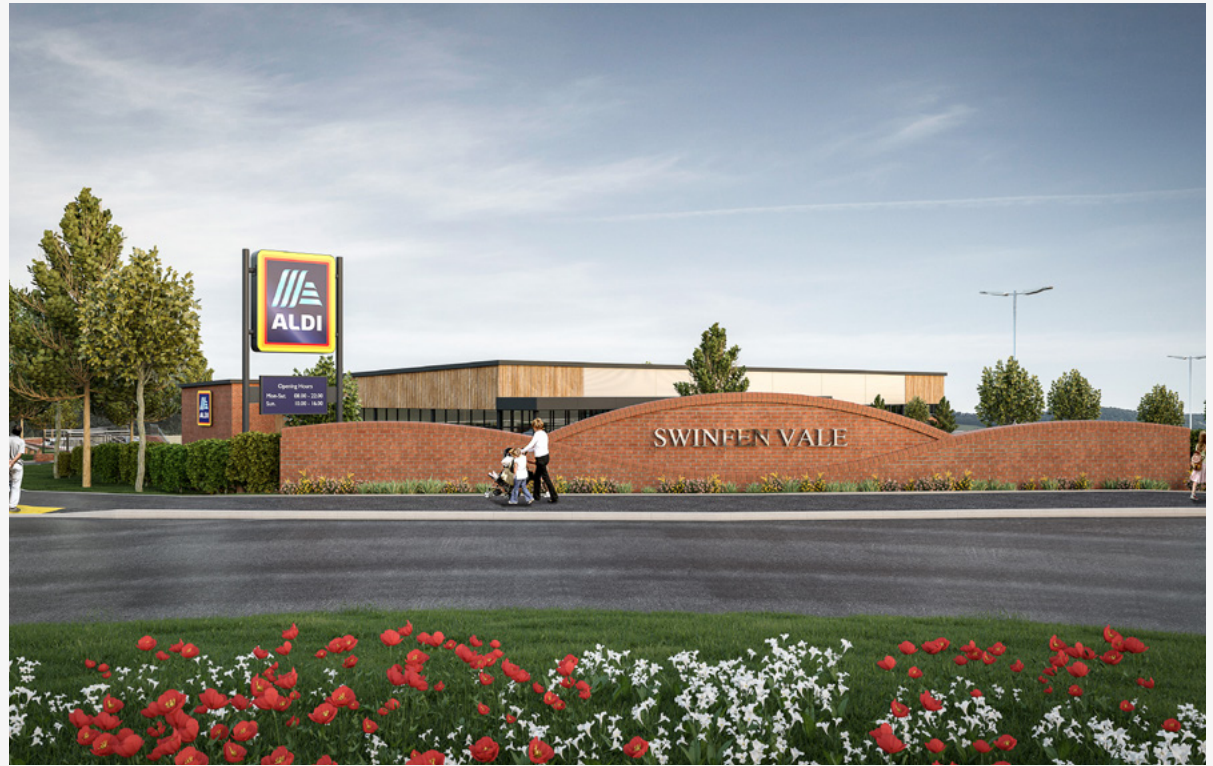
Aldi at Swinfen Vale Visual

Aldi Stores secured reserved matters planning permission (Ref: 22/01499/REMM) for the construction of a 1,606sqm food store at the Swinfen Vale Local Quarter, fronting Beveridge Lane. Aldi Stores' retail provision forms part of the approved 2,000sqm of retail space, leaving 300sqm of available retail space.