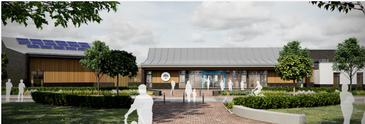
Harworth Forest School Concept - Main Entrance

As part of its commitment to create a sustainable new community at South-East Coalville, Harworth Group are constructing a two-form entry, forest setting, primary school set to complete autumn 2024. The school is located immediately to the northeast of the Local Quarter.